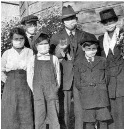
Photo of the family wearing masks during the Spanish flu pandemic in the 1918-1920. s. Who will see an important detail in the picture? ❤️

Aren't you glad don't have to mask a cat!