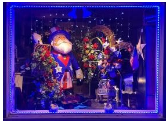
Festive 4th of July window display in downtown Scottsville!