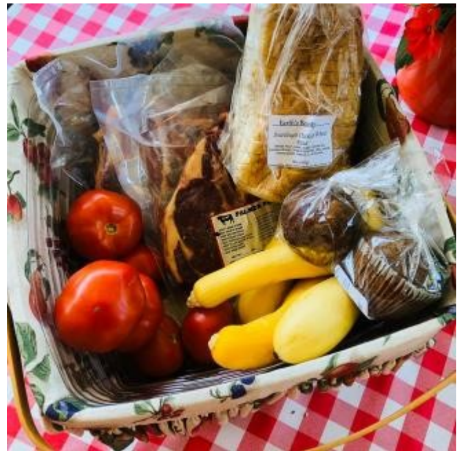
Goodies from Murray!

the Paducah Farmers' Market in Downtown Paducah is open each Saturday starting at 7:30 am and have fresh produce and local artisan goods for sale. Ride in, walk down, or stop by to shop and enjoy all Downtown has to offer.